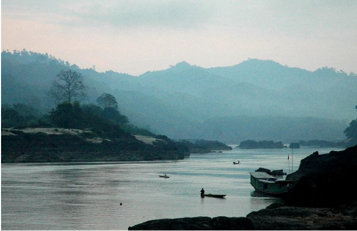
Site of the proposed Xayaburi Dam

At the time of writing (early May) the company proposing Xayaburi Dam is adamant that the project will go ahead, reassuring its shareholders that the deal is still on. The Lao government has sent mixed messages, initially insisting on its sovereign right to develop water resources on its own section of the river, but then indicating that it would commission an expert review of the Environmental Impact Assessment before proceeding. Meanwhile the Prime Ministers of Vietnam and Cambodia have made an unequivocal joint statement that the dam should go