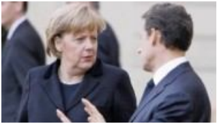
France, Germany see budget discipline as key in crisis