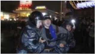
Thousands protest Russian election