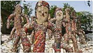
In India, a secret garden that rocks